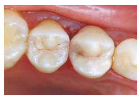
Finished Polofil Supra restoration